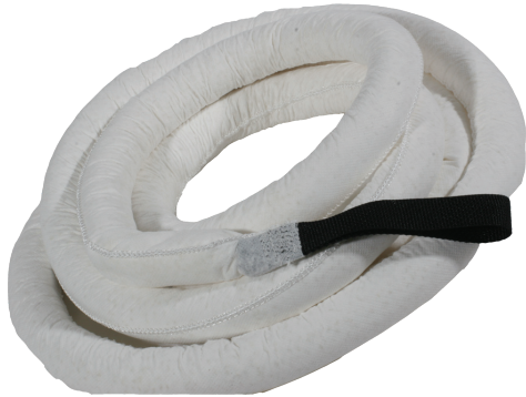
C.I. Agent Marine Boom