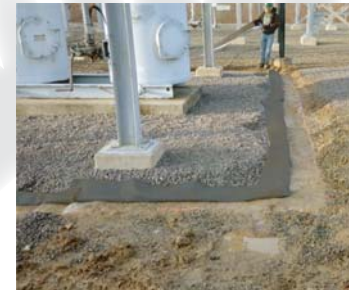
Boom with flap supported by stake